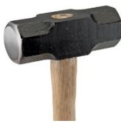
4. Hammer (3 lb.)