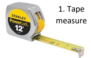
1. Tape measure