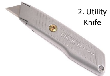
2. Utility Knife