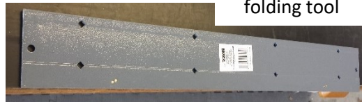
3. Modified sheet metal folding tool